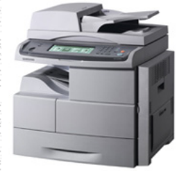
A4 B/W 40-49 PPM MFPs