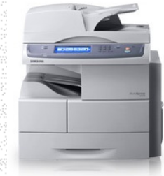
A4 B/W 40-49 PPM MFPs