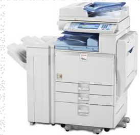
A3 B/W 40-49 PPM MFPs