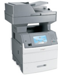
A4 B/W 40-49 PPM MFPs