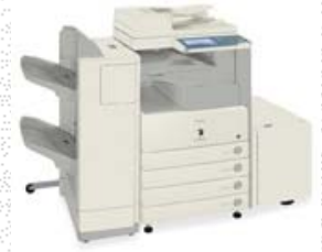
A3 B/W 33-39 PPM MFPs